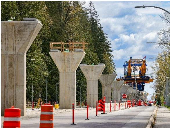
Figure 3: The Surrey Sprinter building the guideway, working within Green Timbers Urban Forest.