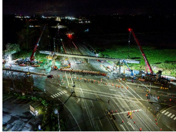
Figure 2: The first of two steel guideway beams (girders) installed above Highway 15.