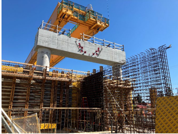
Figure 1: The Fleetwood Flyer constructing spans of the elevated guideway above Fleetwood Station.