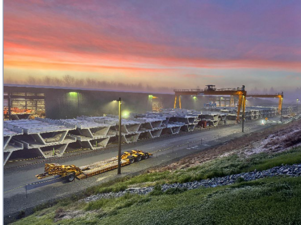
Figure 1: Precast Concrete Facility where guideway segments are produced and stored.