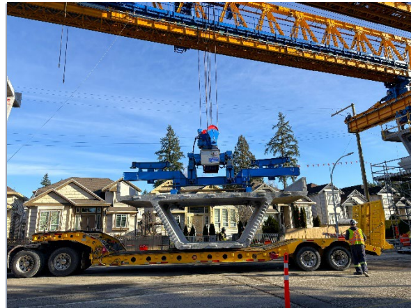
Figure 4: Guideway segment being lifted into place by a launching gantry.