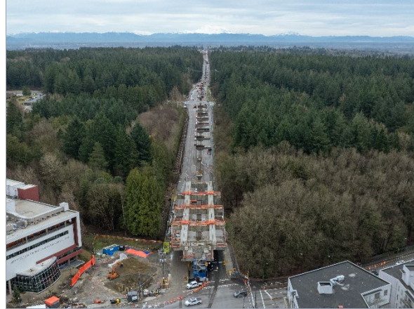
Figure 2: Green Timbers Station and the future guideway down the centre of Fraser Highway looking east.