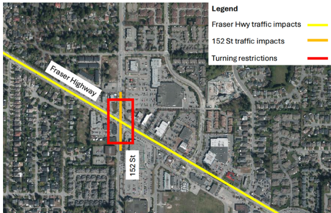
Map: Lane closures and turning restrictions on Fraser Highway and 152 Street.

Construction for the Surrey Langley SkyTrain is underway. Activities include foundation construction, consisting of foundation construction, pier construction, utility relocations, installation of new utilities to power the SkyTrain and road works. Night work is required to support these activities and reduce overall traffic impacts from August 5 to August 21, 2025. During a portion of this work, there will be turning restrictions at the 152 Street and Fraser Highway Intersection during night work.