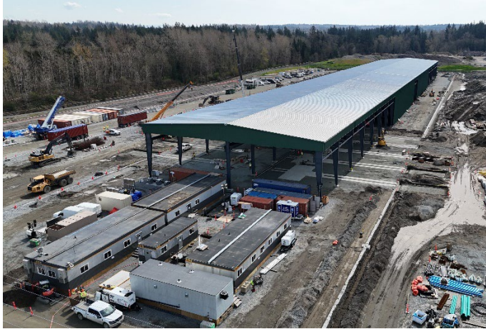
Figure 1: Precast concrete facility where guideway segments will be produced and stored.