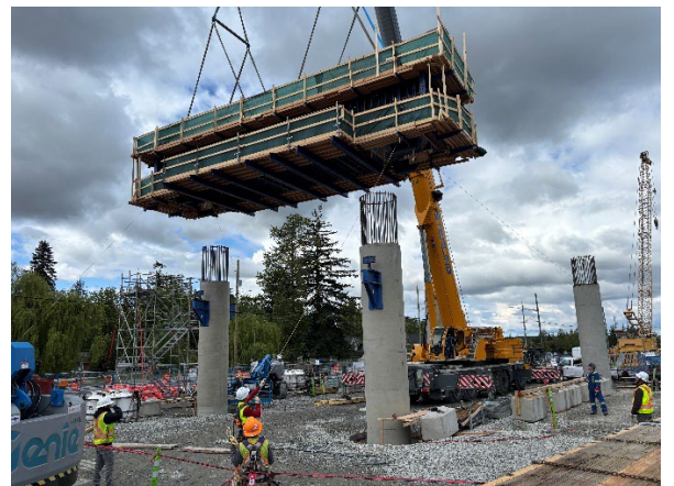
Figure 4: Installation of a bent formwork on top of piers at the future Hillcrest-184 Street Station.