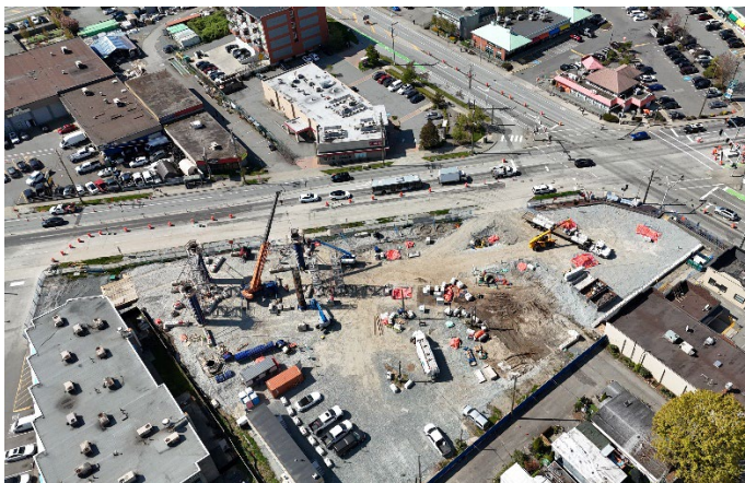
Figure 3: Construction progress at the future site of Fleetwood Station.