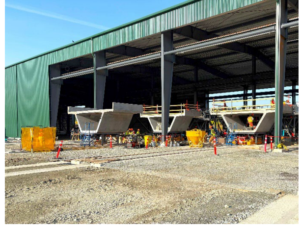
Figure 2: Concrete guideway segments cast at the precast concrete facility.