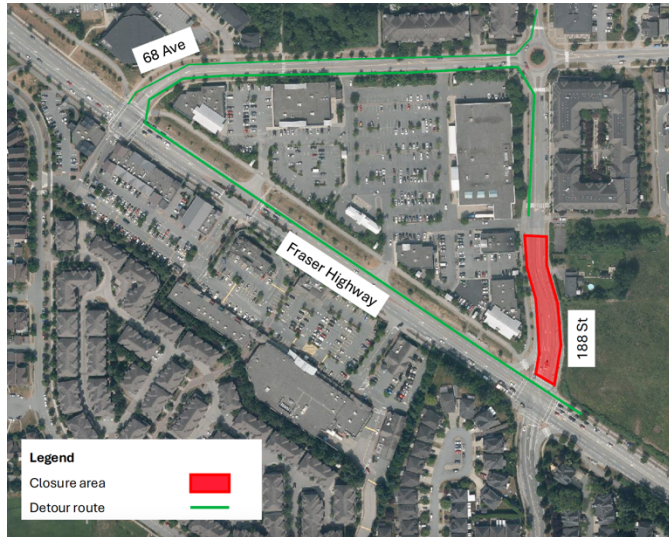
Map: Closure of 188 Street, north of Fraser Highway.

Construction for the Surrey Langley SkyTrain is underway, including the installation of new utilities to power the future SkyTrain.