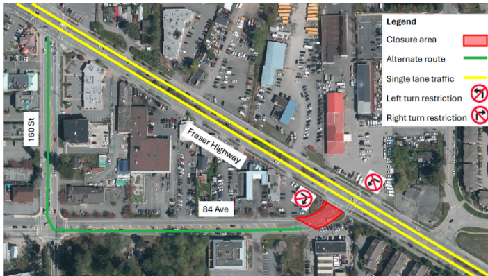
Map: Traffic impacts at 84 Avenue and Fraser Highway.

Construction for the Surrey Langley SkyTrain is underway. Activities include foundation construction, consisting of pile drilling, pier construction, utility relocations, installation of new utilities to power the SkyTrain and road works.