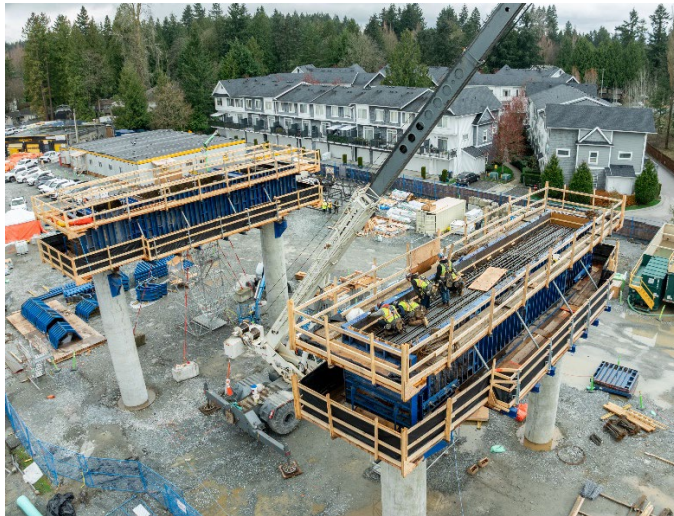
Figure 3: Pier and bent construction at the site of the future 152 Street Station.