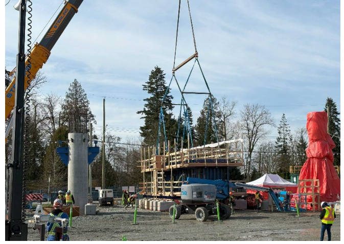
Figure 2: Bent formwork being lifted on top of piers at the future site of Hillcrest-184 Street Station.