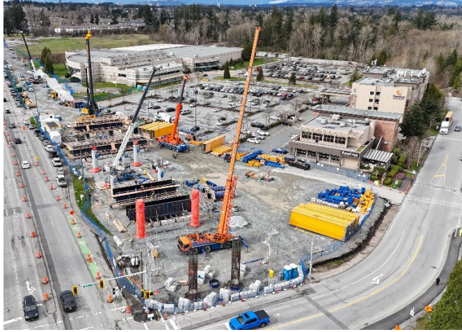
Figure 1: Construction progress at the future Bakerview - 166 Street Station.