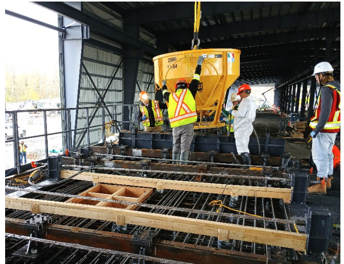
Figure 4: First guideway segment being cast at the Precast Concrete Facility.