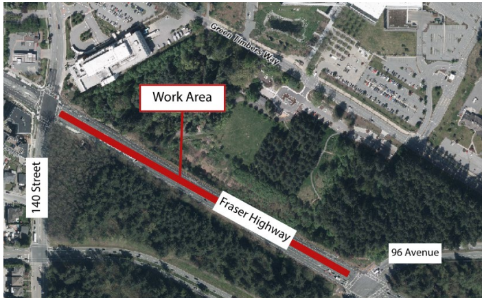
Map: Work area at the Green Timbers Station Site

Construction is actively underway for the Surrey Langley SkyTrain project. Our stations and guideway contractors are currently working at the future Green Timbers Station , located within the road closure area on Fraser Highway between 140 Street and 96 Avenue. Construction activities include foundation construction using drilled piles, concrete pours, utility work, guideway construction and station construction. To support this work night work is required through the end of October 2025.