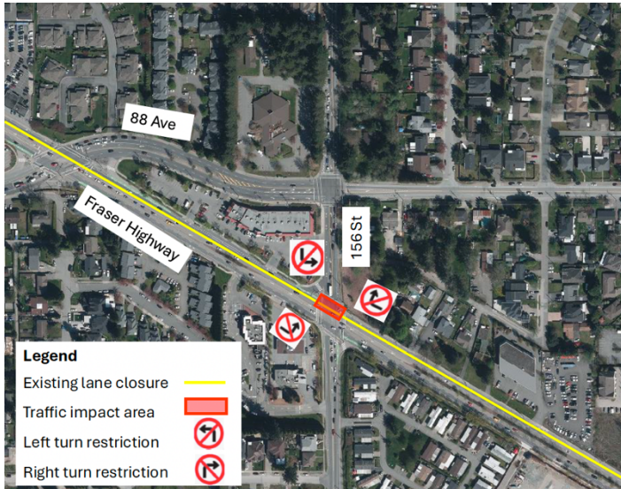
Map: Lane closures and turning restrictions on Fraser Highway at 156 Street.

Construction for the Surrey Langley SkyTrain is underway. Activities include construction of a new utility crossing, within the intersection of Fraser Highway at 156 Street, to supply power for the future SkyTrain.