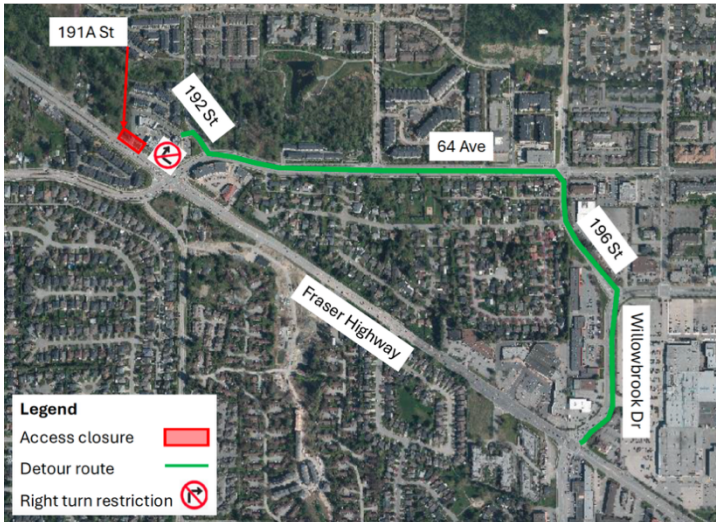
Map 1: Traffic impacts at 191A Street and Fraser Highway with Willowbrook Drive detour route.