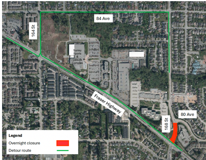
Map: Nighttime closure of 168 Street, north of Fraser Highway.

Construction for the Surrey Langley SkyTrain is underway. Activities include construction of new utilities to supply power for the future SkyTrain, roadwork, foundation construction, and guideway construction.