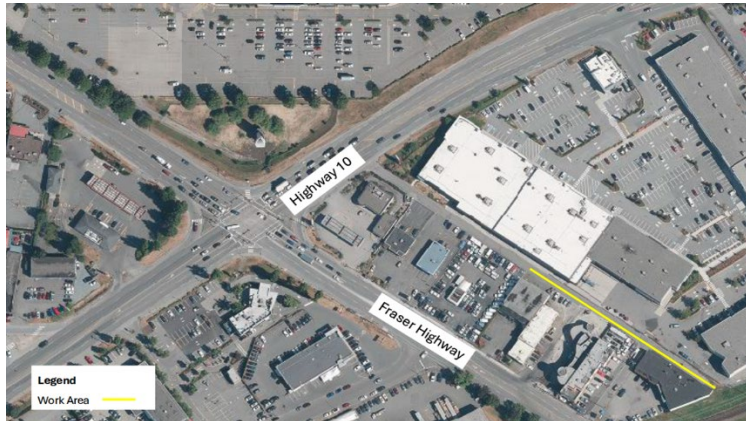
Map: Work area for upcoming utility locate activities.