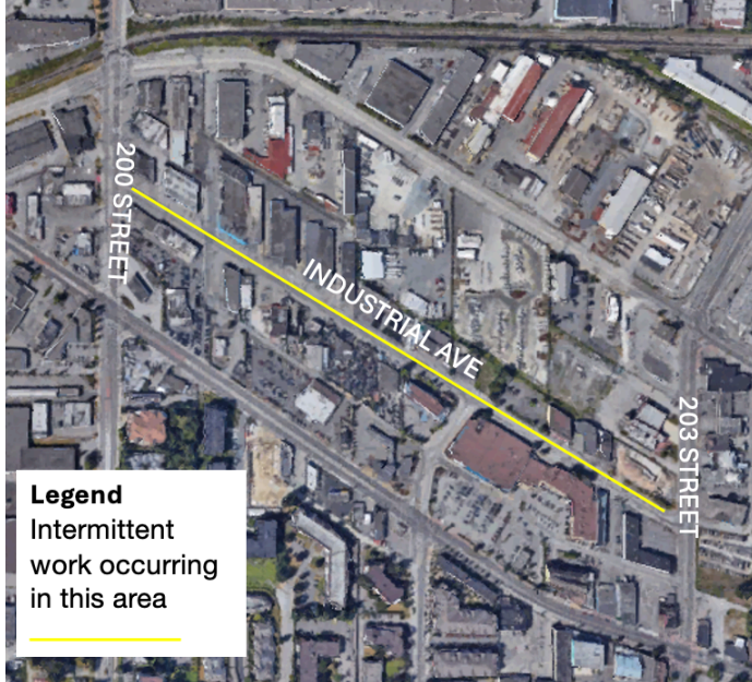
Map: Industrial Avenue from 200 Street to 203 Street

Preliminary activities for the Surrey Langley SkyTrain Project will occur intermittently on Industrial Avenue from 200 Street to 203 Street from March 19, 2025 through spring 2025. These activities are short and will move throughout Industrial Avenue. Activities include survey work, utility investigation and vegetation management. Depending on the activity, various kinds of construction equipment will be used in the area.