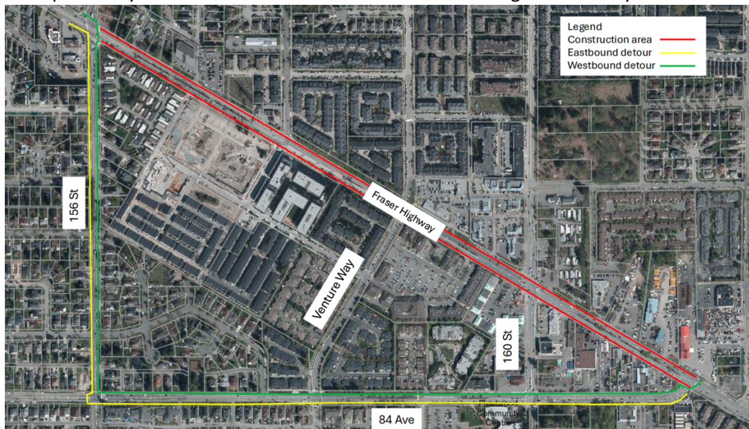
Map: Cycling detour via 156 Street and 84 Avenue