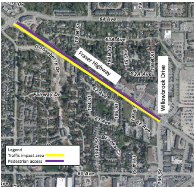
Map: Traffic pattern change on Fraser Highway between 64 Avenue and 196 Street.

Construction for the Surrey Langley SkyTrain is underway in this area. Activities include moving existing utilities to allow for construction, installing new utilities to supply power for the future SkyTrain, roadwork and foundation construction. To support this work, the following traffic pattern change will be in effect from approximately mid-February to summer 2025: