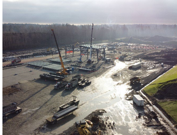
Figure 2: Foundation construction underway at the Surrey Langley SkyTrain pre-cast yard for the guideway segments production building.