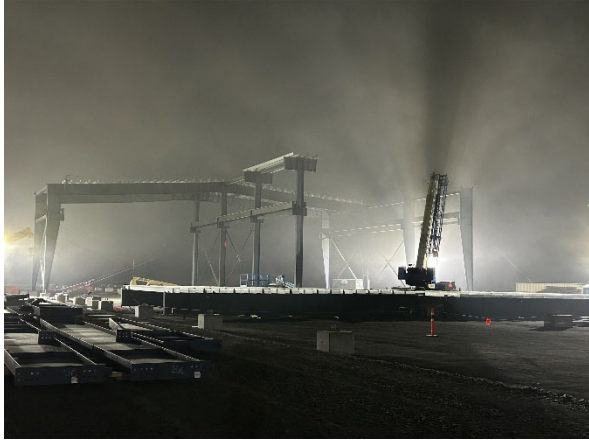
Figure 1: Early morning view of the precast yard preparation where the guideway segments will be fabricated and stored.