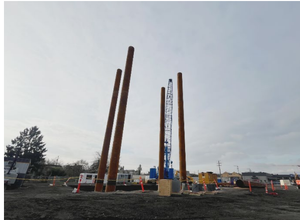
Figure 4: Test piling underway at the site of the future Langley City Centre Station to support the future SkyTrain infrastructure.