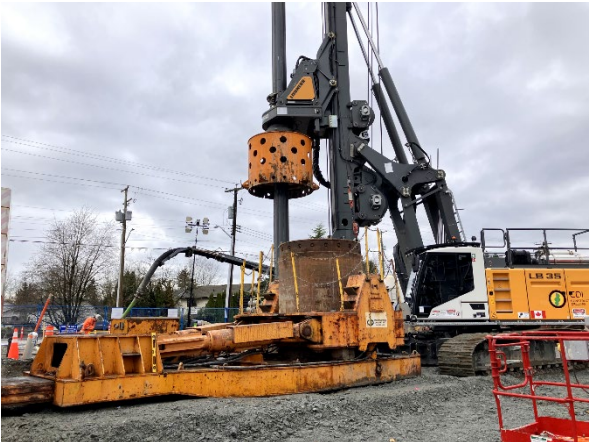
Figure 3: Pile drilling to prepare the site of the future 152 Street Station underway at Fraser Highway and 152 Street.