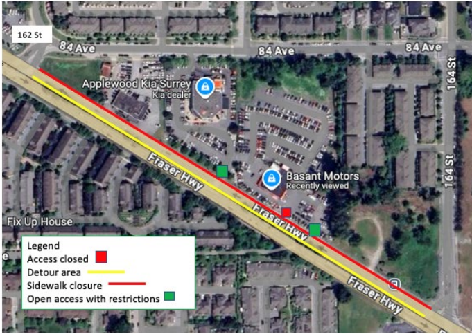
Map: Traffic pattern change on Fraser Highway between 162 Street and 164 Street.

Businesses will remain open and accessible during construction. Please refer to TransLink signage and their website ( TransLink.ca ) for the latest information about bus service in this area.