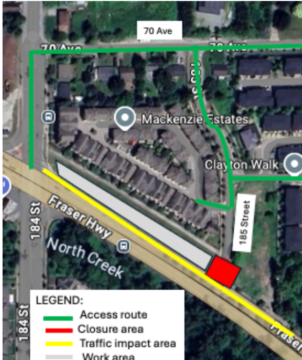
Map: Construction and traffic impact area between 184 Street and 185 Street

Construction for the Surrey Langley SkyTrain is beginning in the area. Activities include roadworks, utility work, foundation construction, and other activities.