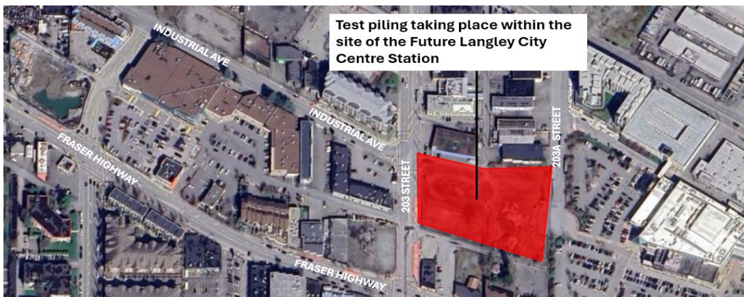
Map: Approximate work area (shown in red) at Industrial Ave and 203 Street

The work previously planned to start October 21 is being rescheduled. This notice will be updated when a new start date is available. To prepare for the construction of the Surrey Langley SkyTrain, early works are underway in the area. As part of early construction work, crews will complete “test piles” from October 18 to December 1, 2024.* Pile installation involves driving a long metal tube (pile) into the ground to provide the foundation for a structure. The purpose of the test piles is to provide geotechnical information for the design and construction of the new Langley City Centre Station.