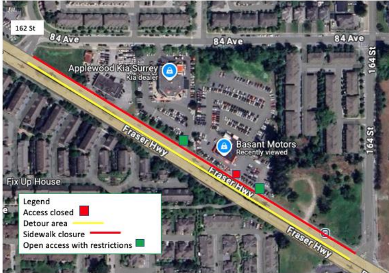
Map: Traffic pattern change on Fraser Highway between 162 Street and 164 Street.

Businesses will remain open and accessible during construction. Please refer to TransLink signage and their website ( TransLink.ca ) for the latest information about bus service in this area.