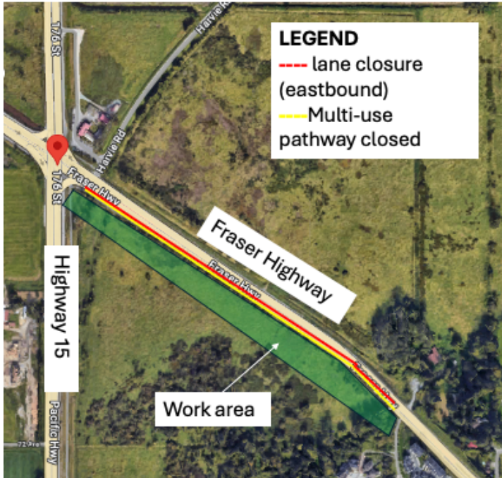
Map: Lane closure (eastbound) and multi-use pathway detour.

Please refer to TransLink signage and their website (TransLink.ca) for the latest information about bus service in this area.