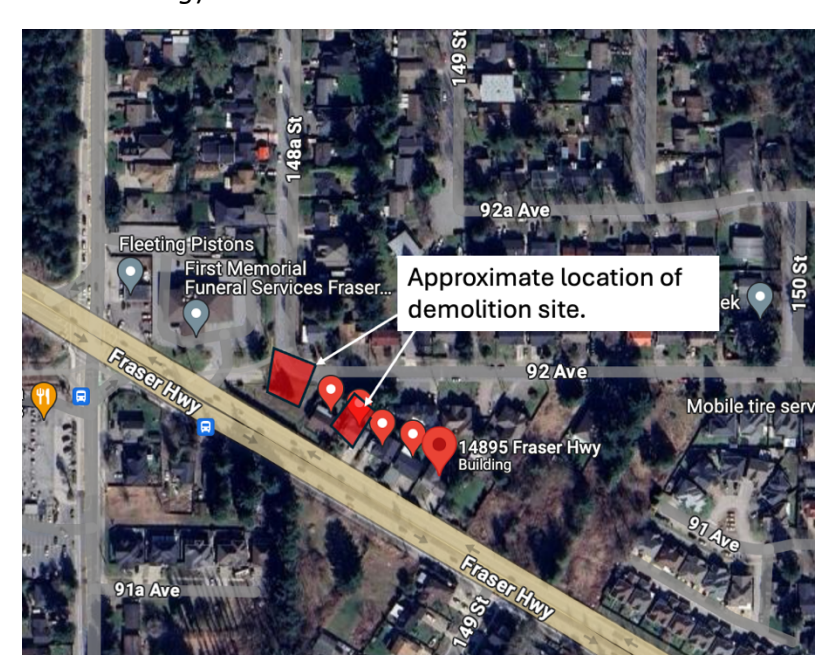
Map B: 14862 92 Ave & 14881 Fraser Hwy